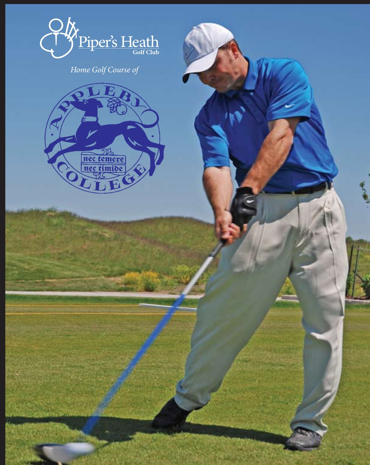
GOLF INSTRUCTION PROVIDED BY CORE GOLF ACADEMY - CANADA